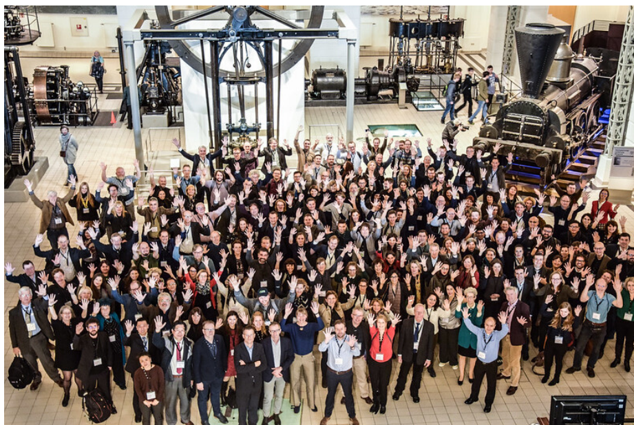
The Europeana Network Association AGM 2018

separate entity on its own within the Europeana ecosystem, but continues to function in a close cooperation with the Europeana Foundation. Another main highlight of this year was the transformation of ENA governance around communities of interest, and the launch of